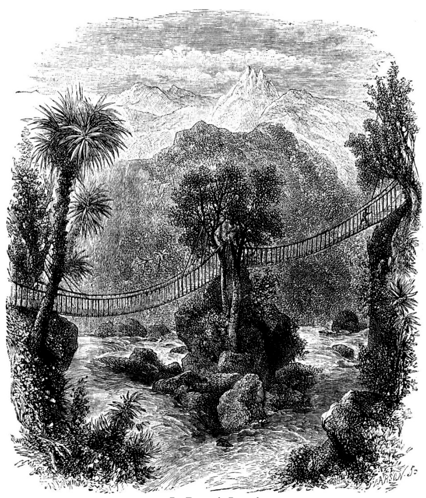
In Battah Land

Let us enter one of the villages. Unhappily we cannot approach them without perceiving that conflict of village with village is the normal state of things. Tread carefully, or you may (unless heavily shod: the natives are bare footed) tear your feet with hidden but sharply-pointed bamboo spikes. Safely past these we reach the one entrance to the village. Sometimes this is underground, and thus easily blocked up. First comes a deep ditch, then a thorny hedge,